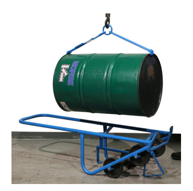
Get a drum horizontal with Morse model 160 Drum Truck. Then lift it with model 41 Drum Lifting Hook.