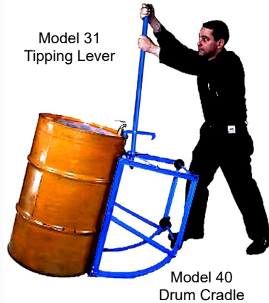
Model 31 Tipping Lever