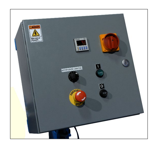
Morse Control Packages (sold separately) include appropriate Control Station for each model

For OSHA compliance in the USA, see OSHA subpart O.1910.212(a)(4) "Barrels, containers, and drums. Revolving drums, barrels, and containers shall be guarded by an enclosure which is interlocked with the drive mechanism, so that the barrel, drum, or container cannot revolve unless the guard enclosure is in place."