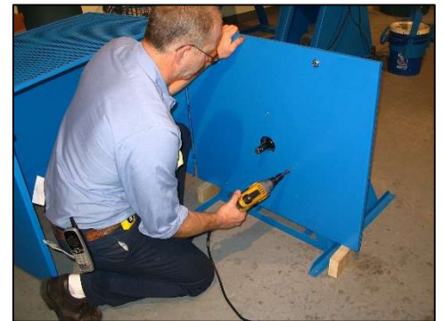
Step 9: Adjust the three casters so bottom of cage is approximately 4" off the floor (shown right). Do not lock in place just yet. Close enclosure and verify that the key aligns properly with the switch. If key is not aligned properly adjust casters accordingly. Key may also be adjusted by loosening its screws and moving (shown left). Once key is aligned properly, lock casters in place by tightening jam nut upward.