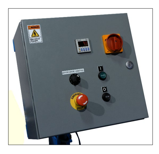
Morse Control Packages (sold separately) include appropriate Control Station for each model

For OSHA compliance in the USA, see OSHA subpart O.1910.212(a)(4) "Barrels, containers, and drums. Revolving drums, barrels, and containers shall be guarded by an enclosure which is interlocked with the drive mechanism, so that the barrel, drum, or container cannot revolve unless the guard enclosure is in place."