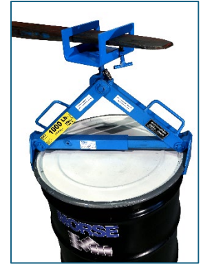
You may also load drum with forklift, using appropriate drum lifting equipment, such as Morse model 284 Fork Hook and model 92 Drum Lifter.