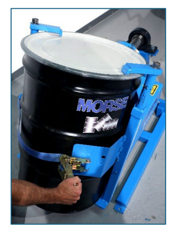
Tighten web strap around drum