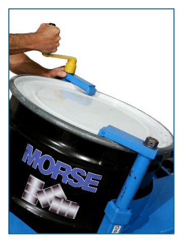
1Tighten both top clamps