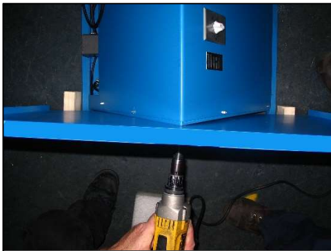
Step 8: Screw 5 self drilling screws through back panel and into the angle frame.