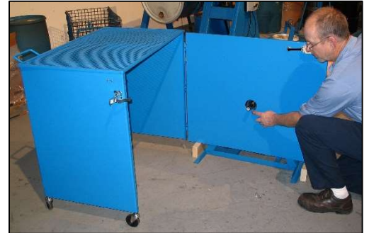
Step 7: Align each self drilling screw near the center of the angle frame.

Step 6: Place the back panel of the enclosure onto the 2" x 4" (51 x 102 mm) spacers and against the frame of the tumbler. Center the hole with the shaft.