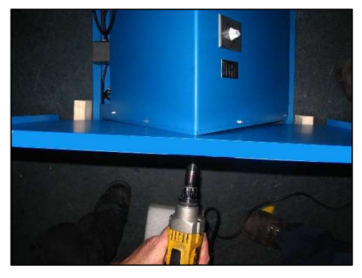
Step 8: Screw 5 self drilling screws through back panel and into the angle frame.