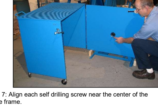
Step 7: Align each self drilling screw near the center of the angle frame.

Step 6: Place the back panel of the enclosure onto the 2" x 4" (51 x 102 mm) spacers and against the frame of the tumbler. Center the hole with the shaft.