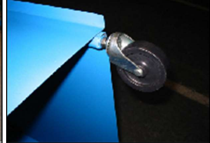
Step 5: Place a 2 x 4 spacer on each side of the frame, these will be used to hold the back panel of enclosure 3-1/2" off the floor.