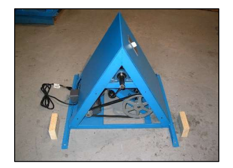
Step 5: Place a 2 x 4 spacer on each side of the frame, these will be used to hold the back panel of enclosure 3-1/2" off the floor.