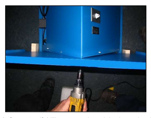
Step 8: Screw 5 self drilling screws through back panel and into the angle frame.