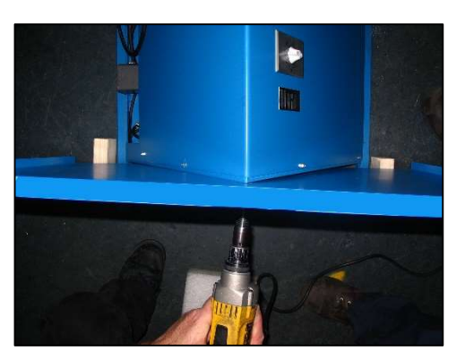
Step 8: Screw 5 self drilling screws through back panel and into the angle frame.