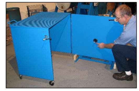
Step 7: Align each self drilling screw near the center of the angle frame.

Step 6: Place the back panel of the enclosure onto the 2 \times 4 spacers and against the frame of the tumbler. Center the hole with the shaft.