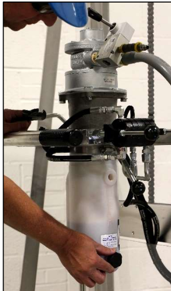
Remove BLACK breather from storage position