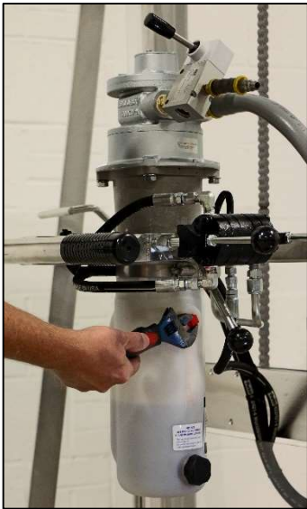
Remove RED shipping plug from the hydraulic reservoir