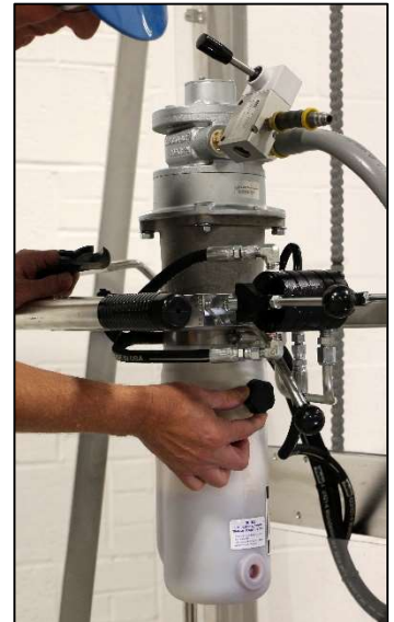
Install BLACK breather in place of RED shipping plug