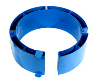
Model 55/30-19GR Diameter Adaptor