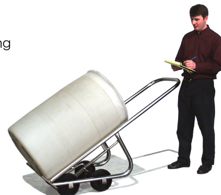
Model 160-SS made of type 304 stainless steel