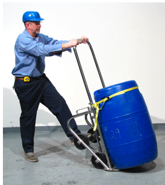
Strap assists in pulling your drum over onto the drum truck.