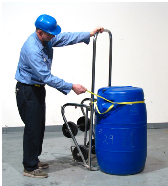
Secure optional strap around a rimless drum.

The Strap Option allows you to handle a rimless plastic drum as shown in sequence of images below, or a shorter drum such as the 30-gallon fiber drum shown at right, with any Morse 4-Wheel Drum Truck.