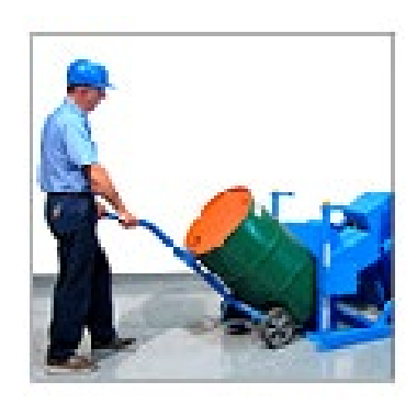
Load drum with drum Ruck