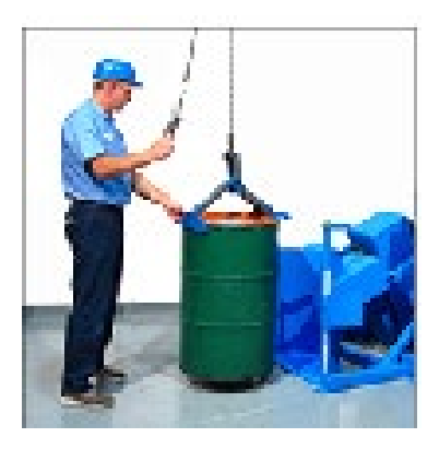
Load Drum with Holst attachment