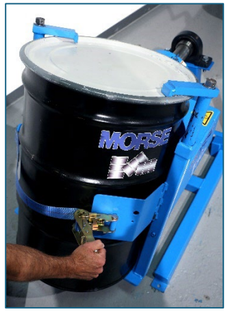
3. Drape the web strap across the face of the drum, and thread through slot in ratchet. Operate ratchet to tighten strap around drum.