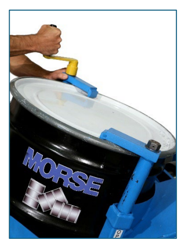
4. Turn the top clamps until they tighten against top of drum. Then remove hand crank BEFORE rotating drum.