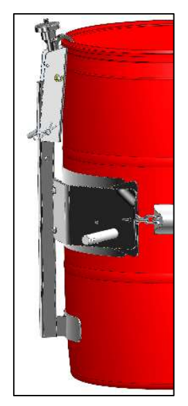
Top Rim Clamp Kit # 4560BSS-P

Install the Top Rim Clamp Kit to handle a RIMMED plastic, steel or fiber drum with suitable top rim.