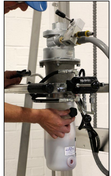
Install BLACK breather in place of RED shipping plug