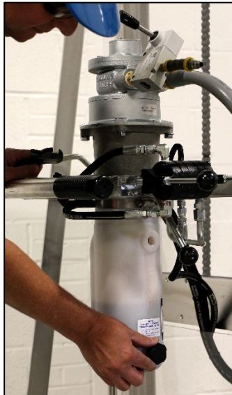
Remove BLACK breather from storage position