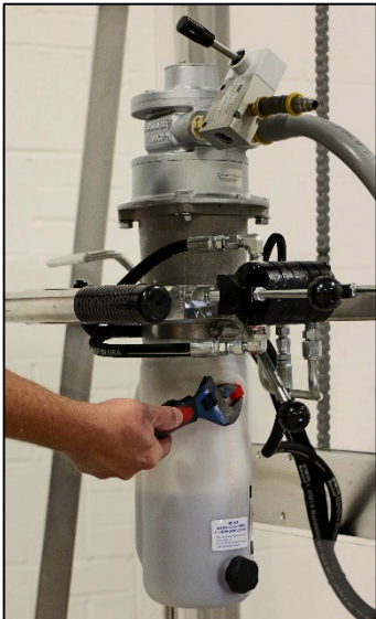
Remove RED shipping plug from the hydraulic reservoir