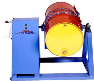
Model 1-300-1-115 shown

Fixed speed End-Over-End Drum Tumblers rotate your drum at 13 RPM.