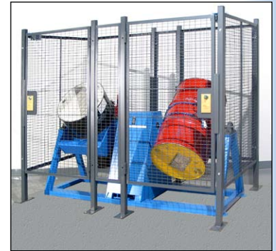
Guard Enclosure GEK-2-300-1-115 (Drum Tumbler sold separately)