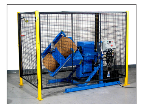
Tilt-To-Load Drum Tumbler with Automated Control Package and Safety Enclosure

A Tilt-To-Load Drum Tumbler with the advanced factory-installed Automated Control Package automatically lifts your drum, rotates for the time you set, and then returns it to upright position at floor-level for easy handling. The built-in safety interlock on the enclosure automatically shuts off the drum rotator when the gate is opened.