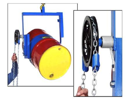
MORStop™ Tilt-Brake on model 185AKontrol-Karrier

The MORStop™ Tilt-Brake extends the tilt control 3" (7.6 cm).