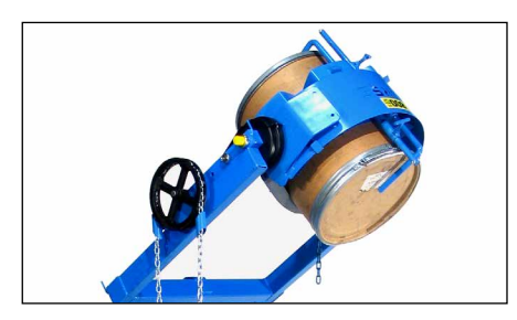
Hydra-Lift Karrier with Model 55/30-16