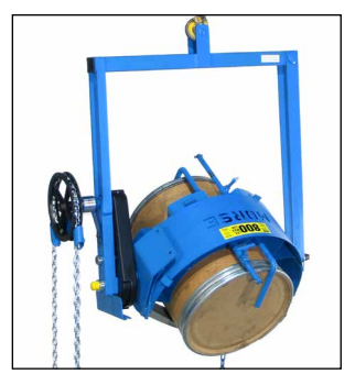
Kontrol-Karrier with Model 55/30-16

Diameter Adapters are made in 1.5" (3 cm) diameter increments for common drum sizes.