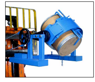
Forklift-Karrier with 55/30-16