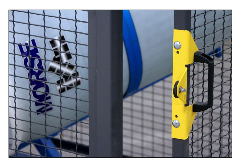
Magnet door closure

Install all Morse Drum Rotators in accordance with OSHA requirements for enclosure and safety interlock, etc. Drum roller automatically turns off when enclosure door is opened. For OSHA compliance, see OSHA subpart O.1910.212(a)(4) "Barrels, containers, and drums. Revolving drums, barrels, and containers shall be guarded by an enclosure which is interlocked with the drive mechanism, so that the barrel, drum, or container cannot revolve unless the guard enclosure is in place." Power connections and motor controls must comply with applicable codes.