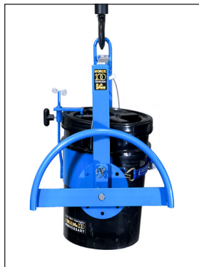
Lock pail upright to transport