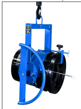
Lock pail in horizontal position to pour