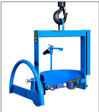
Suspend model 85-5 on your hook