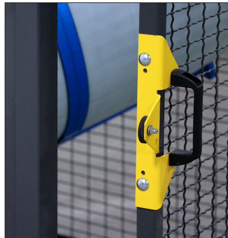
Magnet door closure