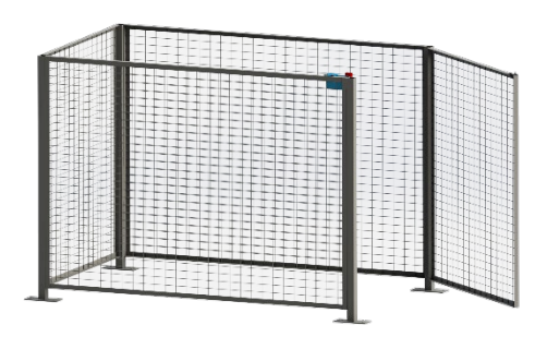
Guard Enclosure Kits with Safety Interlock Switch are sold separately.