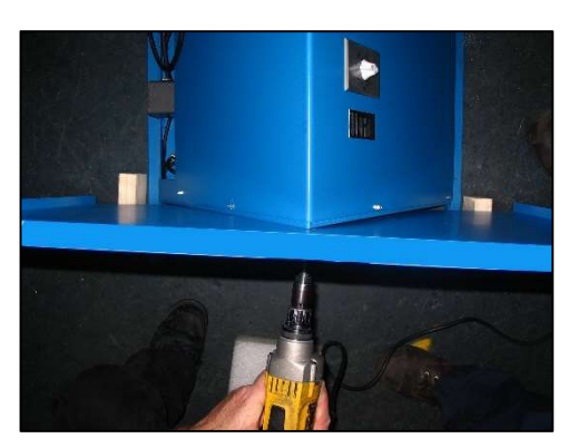
Step 8: Screw 5 self drilling screws through back panel and into the angle frame.