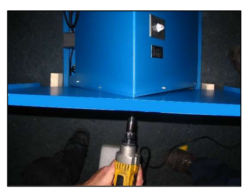
Step 8: Screw 5 self drilling screws through back panel and into the angle frame.