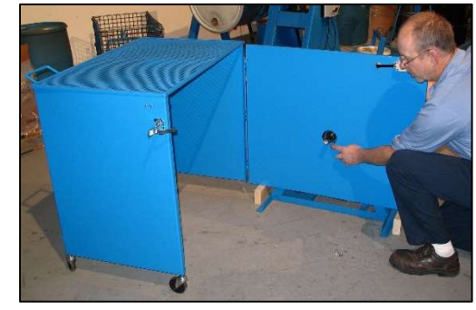
Step 7: Align each self drilling screw near the center of the angle frame.

Step 6: Place the back panel of the enclosure onto the 2" x 4" (51 x 102 mm) spacers and against the frame of the tumbler. Center the hole with the shaft.