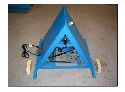
Step 5: Place a 2 \times 4 (51 \times 102 mm) spacer on each side of the frame, these will be used to hold the back panel of enclosure 3.5" (89mm) off the floor.