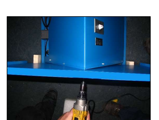
Step 8: Screw 5 self drilling screws through back panel and into the angle frame.

Step 6: Place the back panel of the enclosure onto the 2" \times 4" (51 x 102 mm) spacers and against the frame of the tumbler. Center the hole with the shaft.