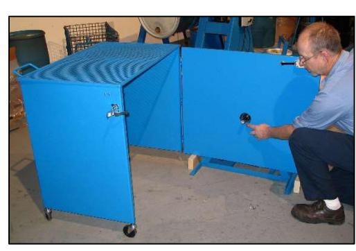
Step 7: Align each self drilling screw near the center of the angle frame.