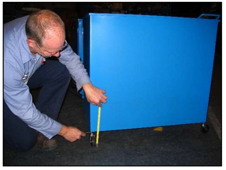
Step 9: Adjust the three casters so bottom of cage is approximately 4" off the floor (shown right). Do not lock in place just yet. Close enclosure and verify that the key aligns properly with the switch. If key is not aligned properly adjust casters accordingly. Key may also be adjusted by loosening its screws and moving (shown left). Once key is aligned properly, lock casters in place by tightening jam nut upward.