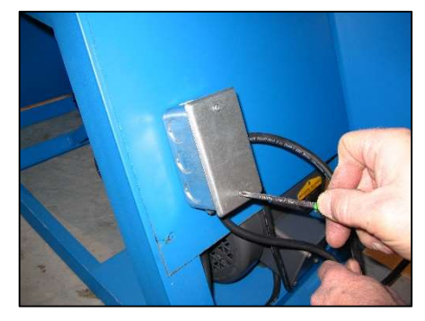
Step 11: Zip tie wires.