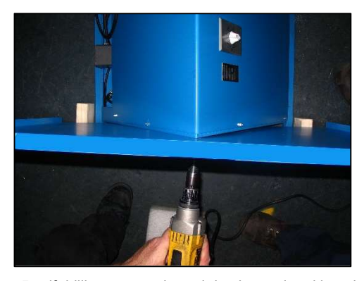
Step 8: Screw 5 self drilling screws through back panel and into the angle frame.