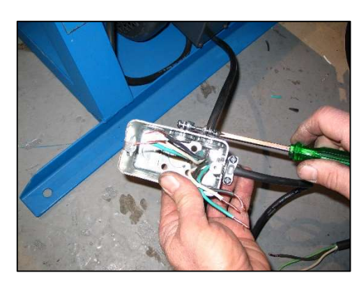
Step 7: Install safety switch wire through the middle side hole. Tighten screws.