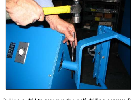
Step 2: Use a drill to remove the self drilling screws from the cover, by inserting the provided bolt to act as a 5/16" screw socket.

Step 1: Remove can holder from drive shaft by knocking out 1/4" roll pin.