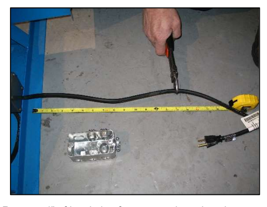
Step 4: Remove 4" of insulation from cut ends and enclosure safety switch cord.