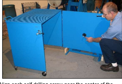
Step 7: Align each self drilling screw near the center of the angle frame.

Step 6: Place the back panel of the enclosure onto the 2 x 4 spacers and against the frame of the tumbler. Center the hole with the shaft.