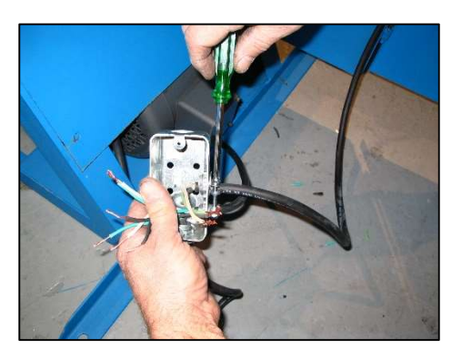
Step 8: Screw junction box to the cover.

Step 6: Install motor wire through the lowest side hole. Tighten screws.