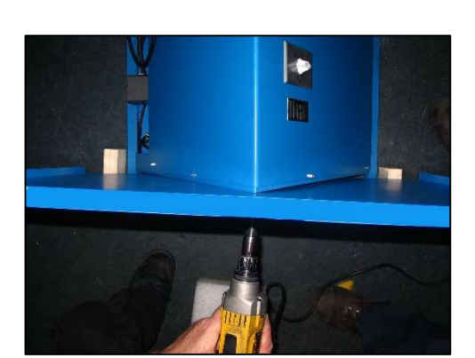
Step 8: Screw 5 self drilling screws through back panel and into the angle frame.

Step 6: Place the back panel of the enclosure onto the 2" \times 4" (51 \times 102 mm) spacers and against the frame of the tumbler. Center the hole with the shaft.