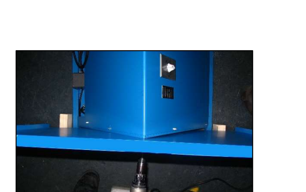
Step 8: Screw 5 self drilling screws through back panel and into the angle frame.

Step 6: Place the back panel of the enclosure onto the 2" \times 4" (51 x 102 mm) spacers and against the frame of the tumbler. Center the hole with the shaft.